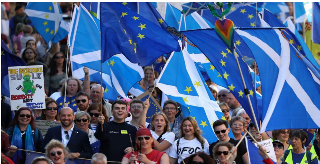
March for independence and EU membership, Edinburgh, September 2023

This means that we must be able to reassure Scottish voters that independence will lead to EU membership . We want to be confident that an independent Scottish application won't be blocked by any EU member country and that our previous 47 years of membership will mean that we won't spend too long outside both the rUK (i.e. the remaining nations of the UK) and the EU.