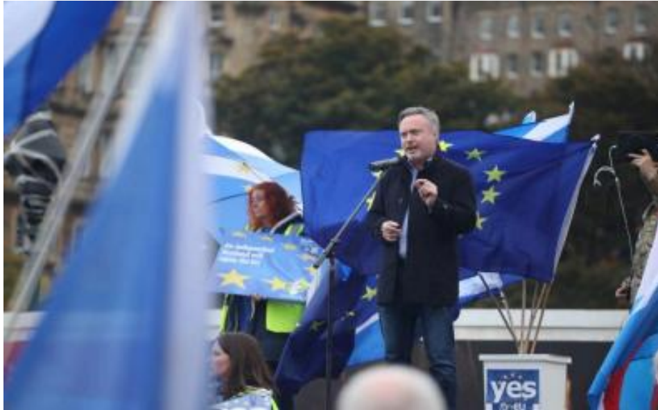
Alyn Smith at a rally in Oct 22.

Former Scottish MEP Alyn Smith declared: “Independence in Europe will transform, revolutionise Scotland. Getting back into the EU will put rocket boosters on our recovery, and at a time when every public budget is under pressure it has never been more important to make Scotland’s connections to the EU real. I’m very proud to be supporting Yes for EU and Europe for Scotland in their efforts, and glad to be part of this important delegation to keep in touch with our friends across the EU.”